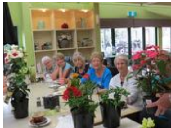
February 2016 Programme meeting at Palmers Garden Centre . Coffee, cake and chrysanthemums!