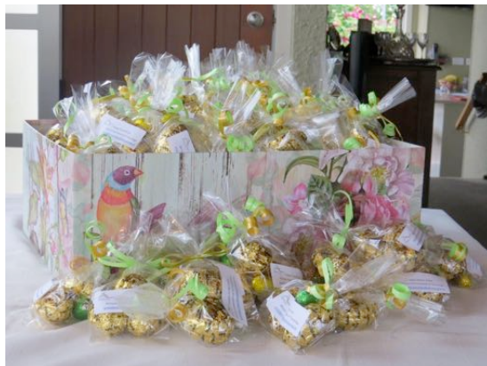
Easter eggs for Meals on Wheels recipients

The Service Committee has been busy packaging the Easter Eggs for delivery to Tauranga Hospital. They looked so nice when they were completed, as the photo below shows.